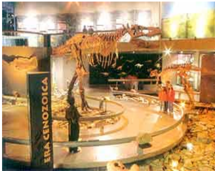
Museum of the Desert

FINANCIAL AID IS AVAILABLE. CONTACT MEXICO 2007 FACULTY FOR MORE INFORMATION.