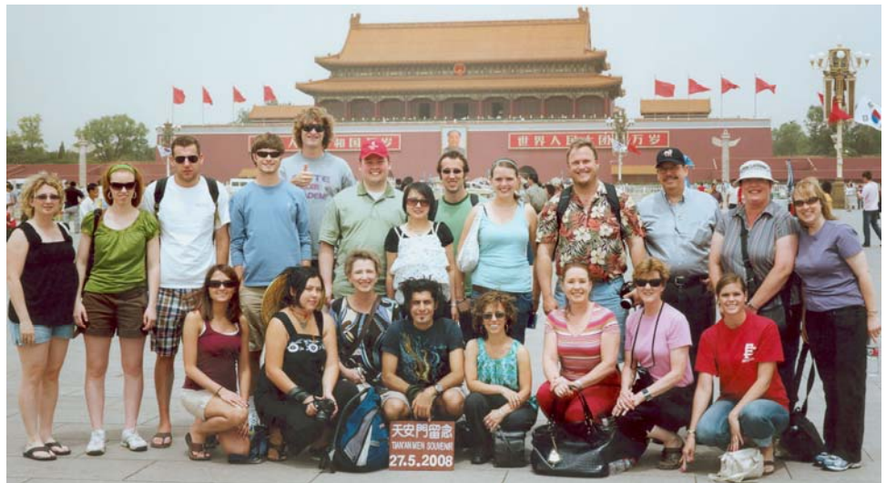
2008 International Business Study Participants

Expand your horizons! Enhance your job prospects! Join us for an educational and fun trip to Beijing, Shanghai, and the Chinese countryside. Meet Chinese students and local business partners of VA/TN companies.. See the Great Wall of China and other magnificent sights in China. All majors welcome. One-three hours credit will be available from UVA-Wise. Your cost for airfare, lodging, ground programs and some meals will be only $1650* . (UVA-Wise tuition extra) The U.S. passport application fee is approximately $100.00.